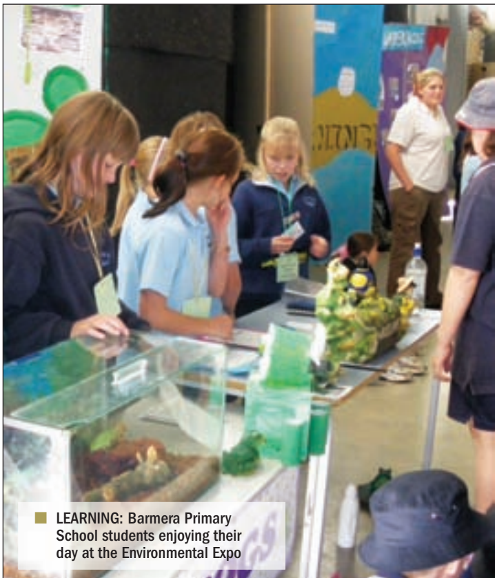
■ LEARNING: Barmera Primary School students enjoying their day at the Environmental Expo