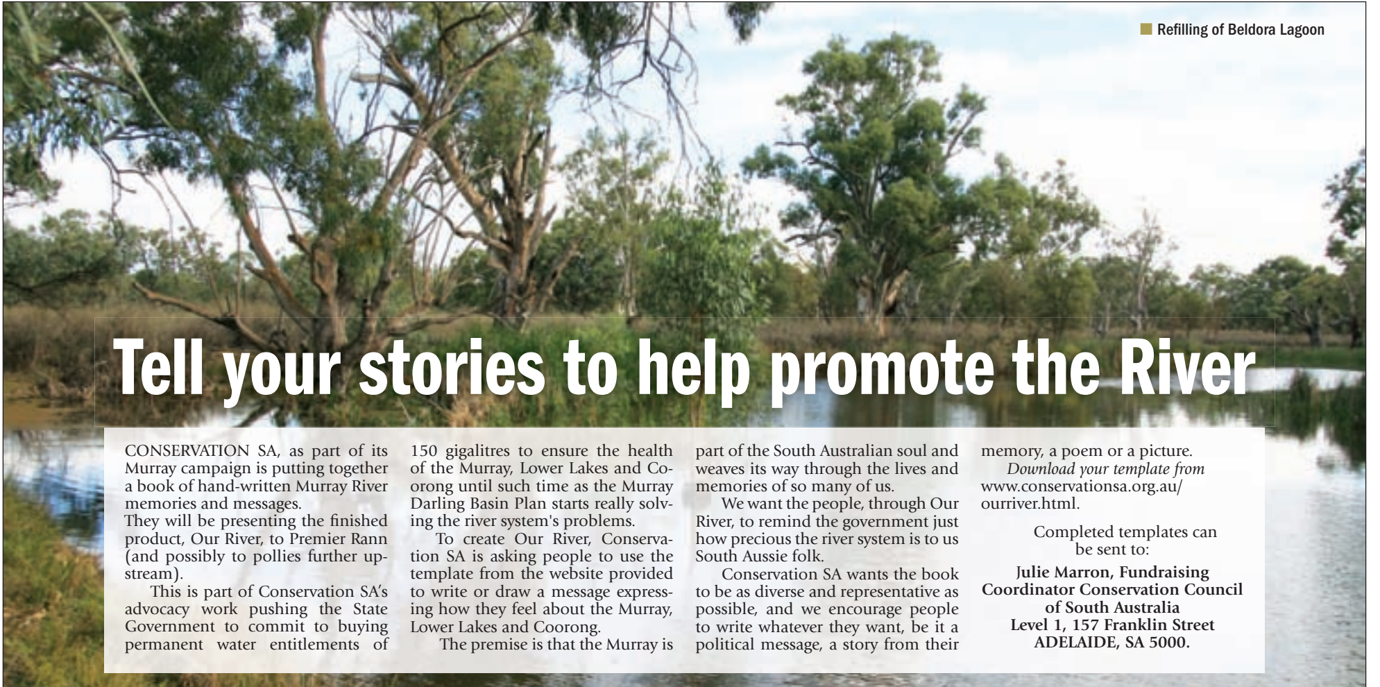
■ Refilling of Beldora Lagoon