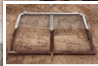
New carp screens have been installed to replace corroded and missing screens at 3 wetlands.

This project was funded from a $20,000 grant from the South Australian Murray Darling Basin Natural Resources Management Board.